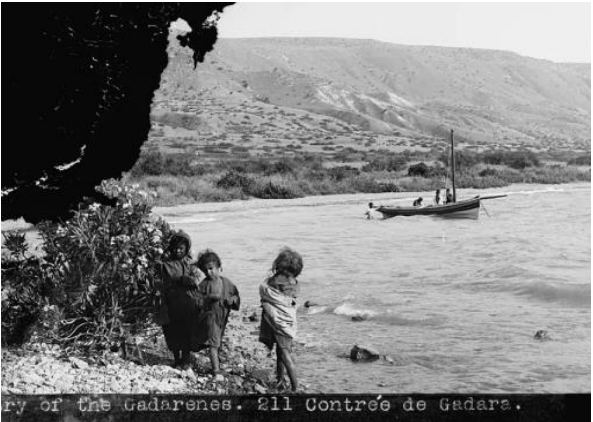
Country of Gadarenes (old picture)

We know that evil is seductive and it hates life and its own. (Psalms 29:24). Another thing that we see and understand today is that evil makes itself comfortable, indispensable, while it sucks the energy out of you. It makes you think it cannot be done without. The idea of a change is scary and it brings about fear. There is no freedom and no good to pursue within the heart and outside of us. It makes you captive with a level of comfort that cannot be overcome. Its misery is seductive.