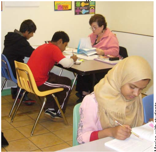
Maries with students