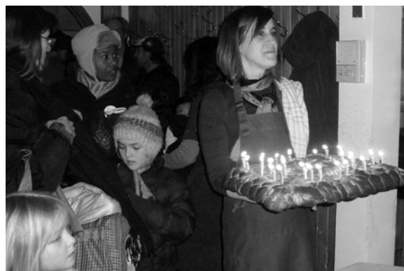
Someone call the fire department!

As usual the food was blessed, the St John Cake was borne in, ablaze with candles, "Happy Birthday" to St John's was sung with gusto and the kitchen became busier than a hive when the Queen Bee enters. The kids especially enjoyed themselves weaving between the tables making sure that everyone was fed. As dessert was being served the St John Cake was distributed and the coins found by two happy newcomer families who went home with $25 food vouchers. As the first wave finished their meal and moved from the tables the second wave moved in to take their places and the band played on! The kids and their adult assistants kicked back into action and quickly the second serving was completed. In all over 140 people joined in the celebration – a worthy testament and celebration of 25 years of St John's.