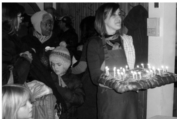
Someone call the fire department!

As usual the food was blessed, the St John Cake was borne in, ablaze with candles, "Happy Birthday" to St John's was sung with gusto and the kitchen became busier than a hive when the Queen Bee enters. The kids especially enjoyed themselves weaving between the tables making sure that everyone was fed. As dessert was being served the St John Cake was distributed and the coins found by two happy newcomer families who went home with $25 food vouchers. As the first wave finished their meal and moved from the tables the second wave moved in to take their places and the band played on! The kids and their adult assistants kicked back into action and quickly the second serving was completed. In all over 140 people joined in the celebration – a worthy testament and celebration of 25 years of St John's.